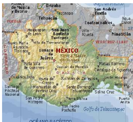
Map of the state of Oaxaca.

AND The state of Oaxaca has been one line, there are other phenotypes It has a very famous personality in terms of late ripening in November. Others can already be to its varieties since the 70s. In general, these lines are later than those of the northern states and cultivated in the mountains. It is said that there are still good varieties in the Sierra and many elderly Mexicans who continue to keep their traditional seeds and grow little treasures to smoke at home.