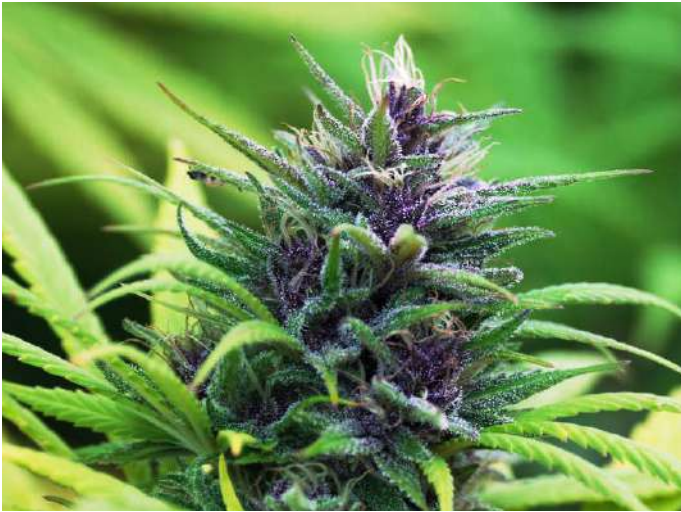
Purple Mexican, image courtesy of Bleuweiss.

RED SNAKE: Hybrid between Oaxaca79 and a Colombian "Red Point" male from Tolima, worked for several generations. a tribute to the first American varieties of the old school, with a stimulating and pleasant effect with a warm touch reminiscent of classic Colombians. With fruity aromas and some candy or chewing gum plants and blooms of 12-14 weeks.